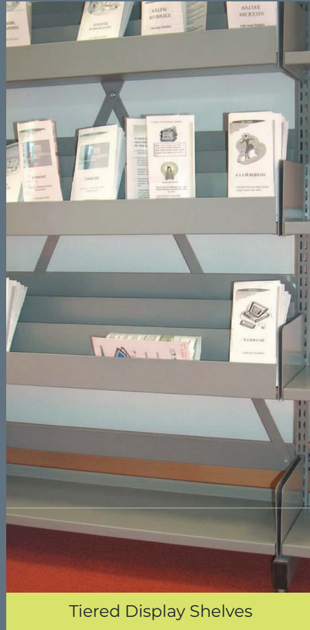
Tiered Display Shelves