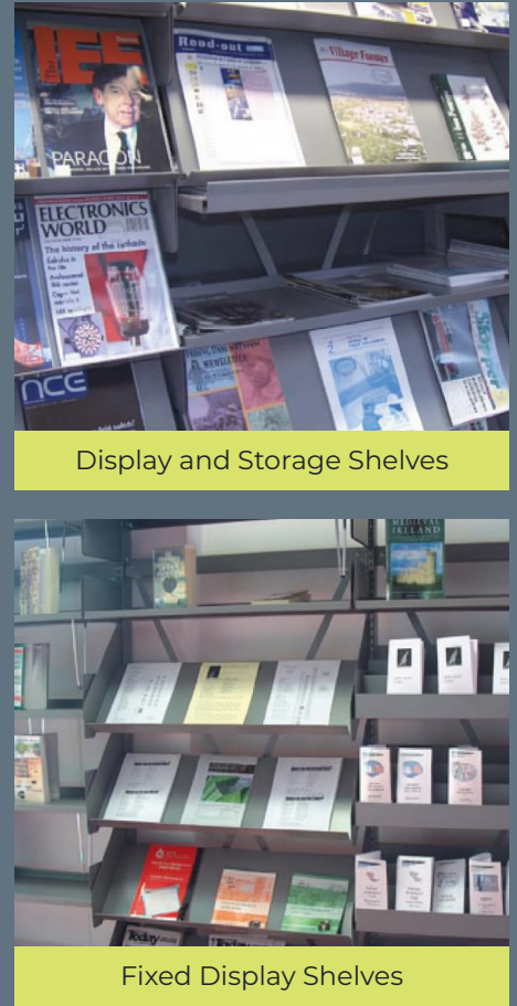
Display and Storage Shelves