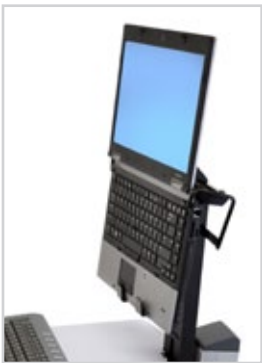
NF Cart Laptop Vertical Kit 97-546