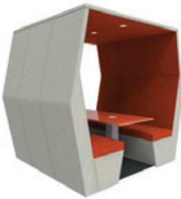
Bill - 6 seat Den