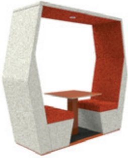
Bill - 2 seat Den