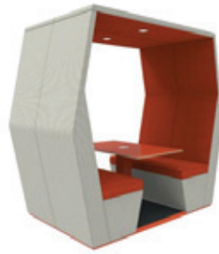
Bill - 4 seat Den