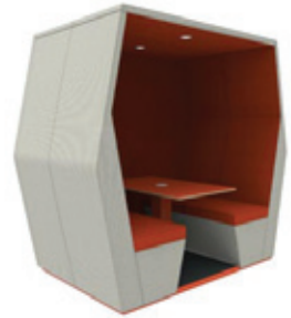
Bill - 4 seat Den with wall