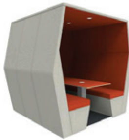
Bill - 6 seat Den with wall