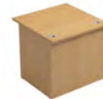
Reception Desk 800D x 740H