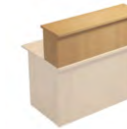
Reception Riser 300D x 370H