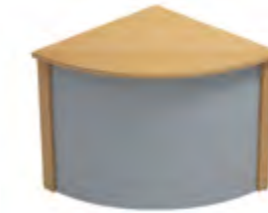
Reception Corner Desk Metal Front 800D x 740H