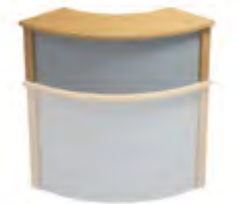
Reception Corner Riser Metal Front 300D x 370H