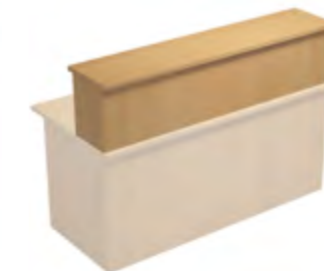
Reception Riser 300D x 370H