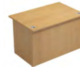
Reception Desk 800D x 740H