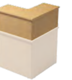
Reception Corner Riser Wood Front 300D x 370H