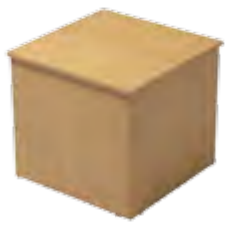
Reception Corner Desk Wood Front 800D x 740H