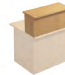
Reception Riser 300D x 370H